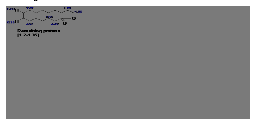
Figure-3: <sup>1</sup> H NMR Proton Assignments.